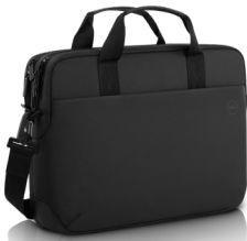
Dell EcoLoop Pro Briefcase - CC5623

Modular Thunderbolt 4 dock with swappable modules for easy upgrades and SuperBoost technologies for fast charging.