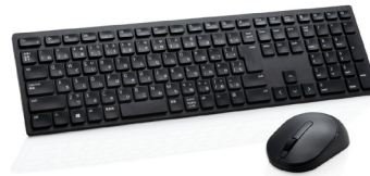
Dell Pro Wireless Keyboard and Mouse - KM5221W

Designed for on-the-go productivity and protection, the Dell EcoLoop Pro Briefcase is made of eco-conscious material to complement any lifestyle.