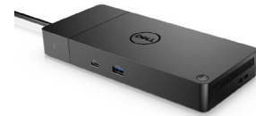
Dell Thunderbolt 4 Dock - WD22TB4

Work from anywhere with this Bluetooth Teams certified headset that lets you switch seamlessly to your PC or smartphone and enjoy crystal clear audio on the go.