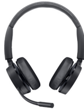
Dell Pro Wireless Headset - WL5022

Get immersive productivity on a 34" WQHD curved monitor with a wide color coverage and extensive connectivity including RJ45, USB-C and quick-access front ports.