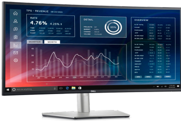
Dell UltraSharp 34 Curved USB-C Hub Monitor - U3423WE

Get immersive productivity on a 34" WQHD curved monitor with a wide color coverage and extensive connectivity including RJ45, USB-C and quick-access front ports.