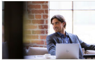
HP EliteBook x360 1020 G2