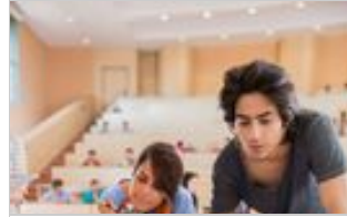
Two students working on an HP Notebook in class