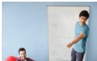
Young professionals collaborate at the office