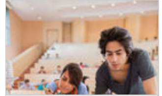
Two students working on an HP Notebook in class