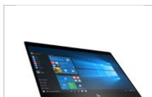
Right facing screen