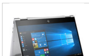
Right rear facing