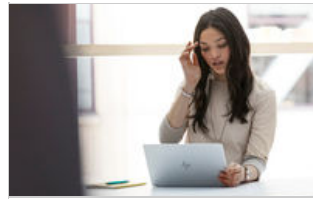
HP EliteBook x360 1020 G2