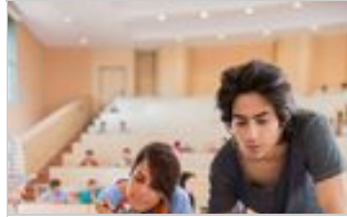
Two students working on an HP Notebook in class