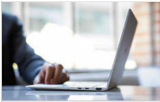
HP EliteBook x360 1020 G2