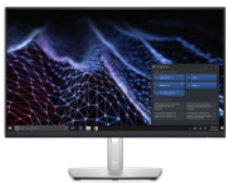
Dell UltraSharp 24 Monitor - U2422H

Elevate your productivity on this 24" FHD monitor with brilliant color coverage and ComfortView Plus, an always on built-in low blue light screen.