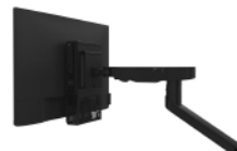
OptiPlex Micro Dual VESA Mount with Adapter Bracket

Adjustable, compact stand for your micro creates a clean, open workspace with minimal cables.