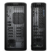
OptiPlex Tower, Small Form Factor Cable Covers

Experience crystal-clear conference-calls with the world's most intelligent Microsoft Teams-certified speakerphone.