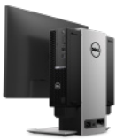
OptiPlex Small Form Factor All-in-One Stand - OSS21

Create a clean workspace for your Small Form Factor with integrated cable management and full range monitor adjustability.