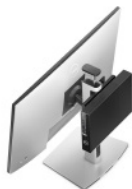
OptiPlex Micro All-in-One Stand - MFS22

Create a clean workspace for your Small Form Factor with integrated cable management and full range monitor adjustability.