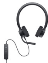
Dell Pro Stereo Headset - WH3022

Enhance your everyday productivity with a quiet full size keyboard and mouse combo that offers programmable shortcuts and 36 months battery life.